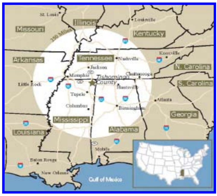
Tishomingo County, Mississippi, is located in the northeast corner of Mississippi adjacent to Alabama and Tennessee.

Proximity to metro areas rounds out the advantages of Tishomingo County. Tishomingo County has earned the respect of vacationers and retired persons who have moved here from all over the USA and Canada.