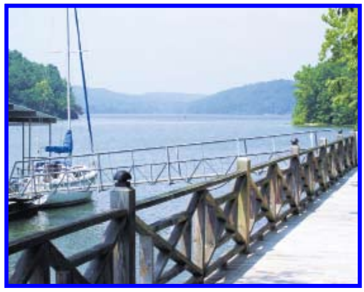
Located on Pickwick Lake, Union Harbor Resort and Marina offers a secluded residential and retirement community on the wooded hills overlooking Pickwick Lake.