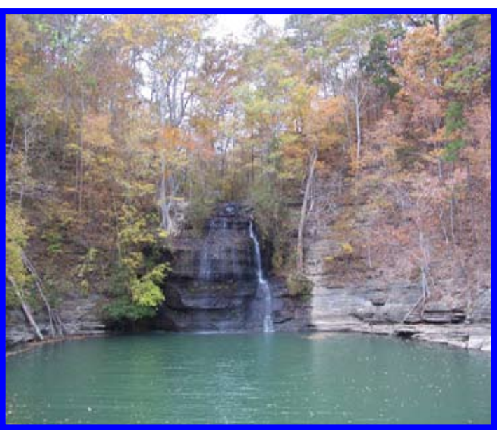
Tishomingo County is famous for its lakes, parks, waterfalls, hilly terrain, and quaint Appalachian villages.

In addition to being widely known as the "Outdoor Recreation Capital of the Mid-South", Tishomingo County has received the following ratings: