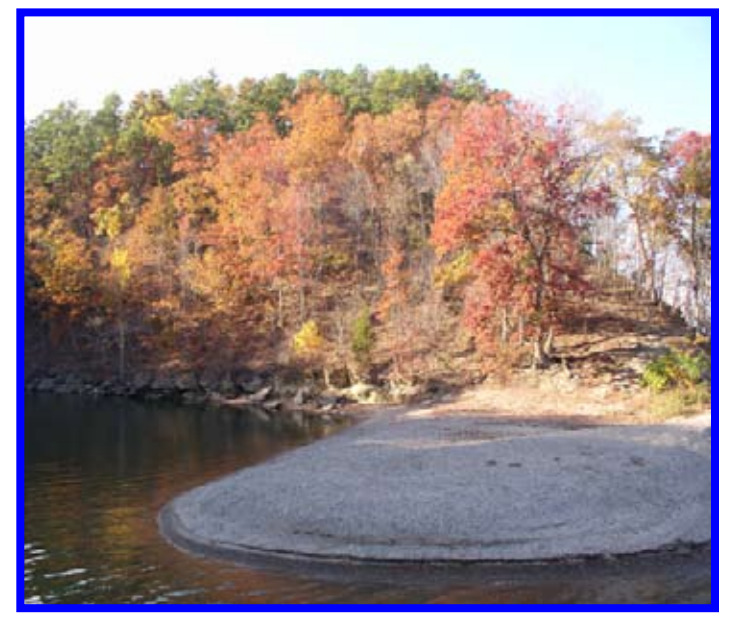
Pickwick Lake is also known for its secluded beaches and hillsides with flowering shrubs and trees in spring and riotous color in autumn.